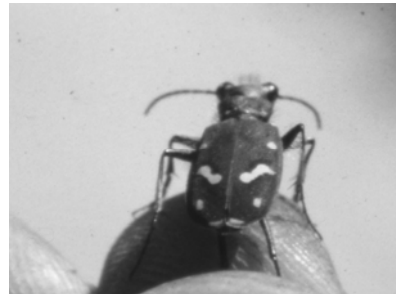
Ohlone tiger beetle ( Cicindela ohlone )