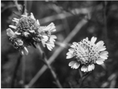
Santa Cruz tar plant ( Holocarpha macradenia )