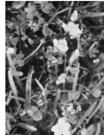
Coastal dunes milkvetch ( Astragalus tener titi )