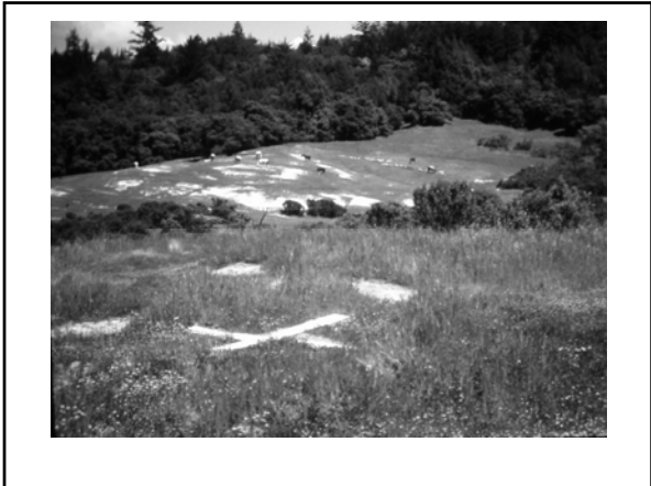
Pacific Grove clover ( Trifolium polyodon )