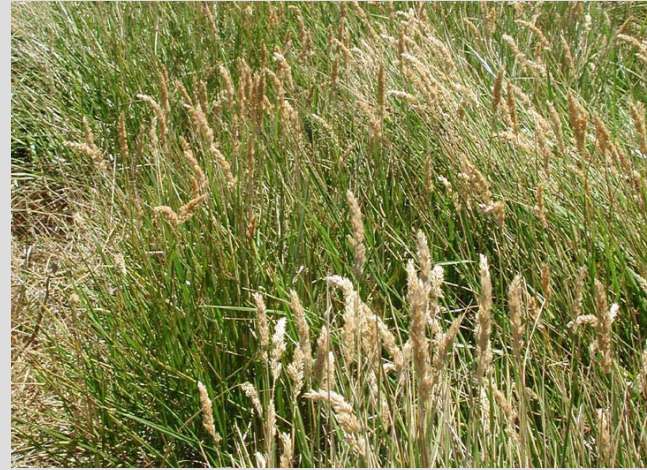
Calamagrostis stricta inexpansa (Thurber's reedgrass)