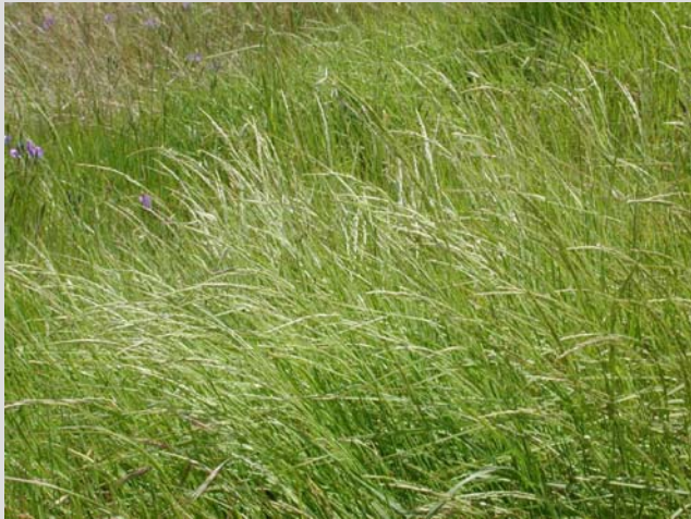
Agrostis pallens (Thinggrass)