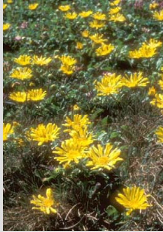
Grindelia stricta platyphylla