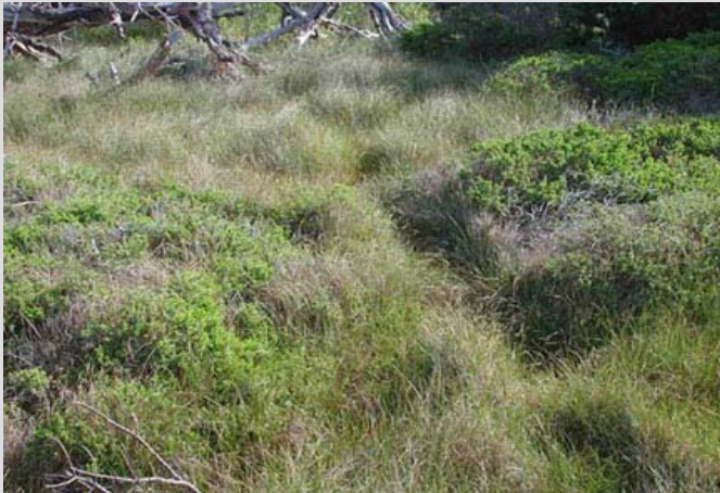
Carex pansa - Asilimar, Pacific Grove