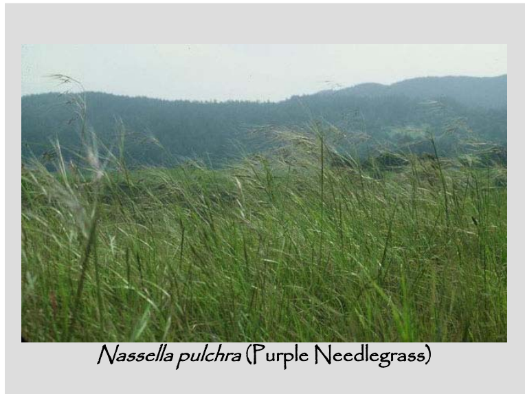
Nassella pulchra (Purple Needlegrass)