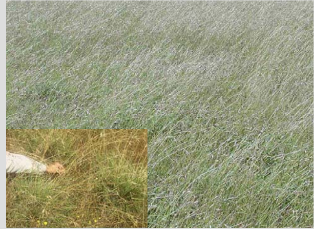
Danthonia californica (California oatgrass)