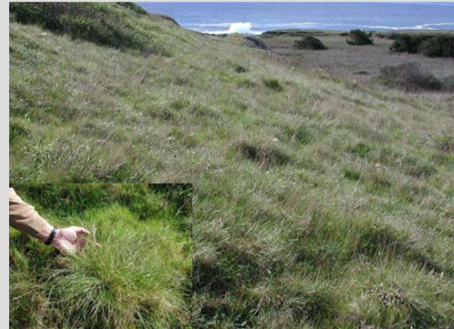
Festuca idahoensis roemerii – Pt. Cabrillo