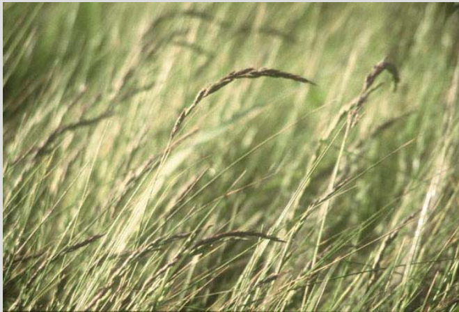
Festuca idahoensis roemerii (Idaho fescue)