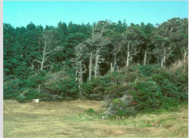
Coastal Prairie - Fort Bragg