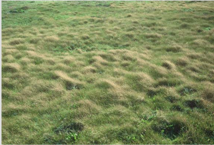
Festuca rubra ~ Jughandle