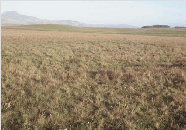
Coastal Prairie - San Simeon