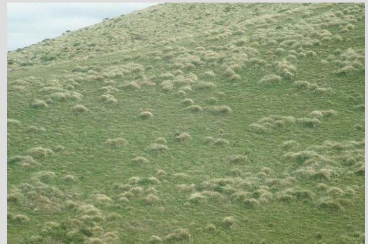
Deschampsia caespitosa holciformis (Tufted hairgrass)