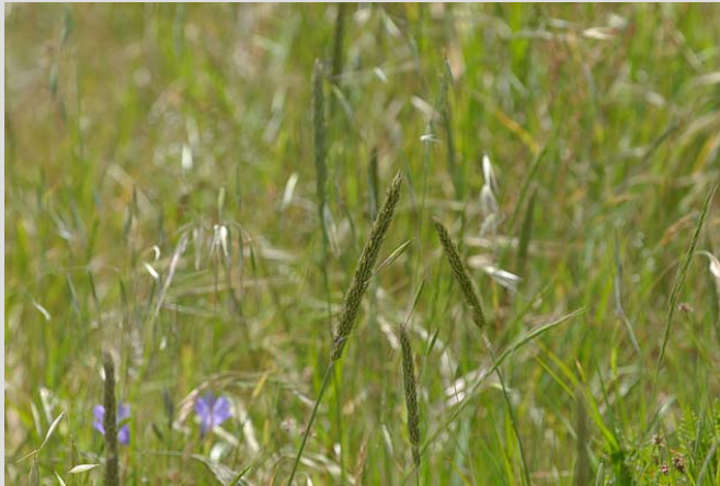
Koeleria macrantha (Junegrass)