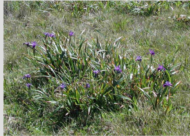
Iris douglasiana (Douglas Iris)