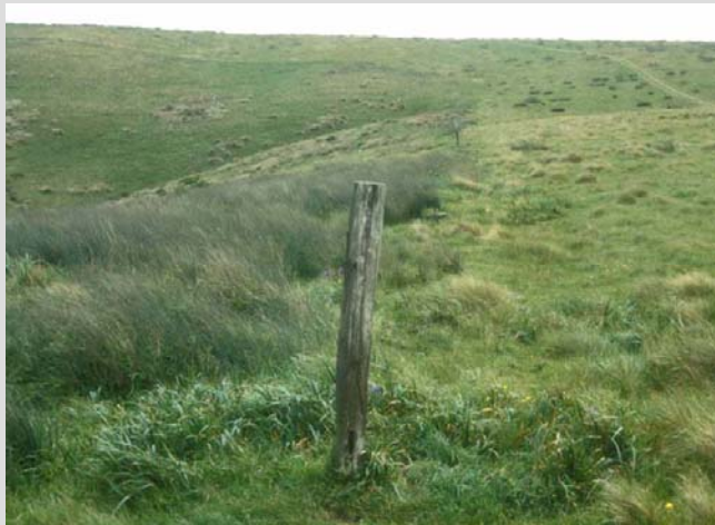
Land Use ~ Cultivation