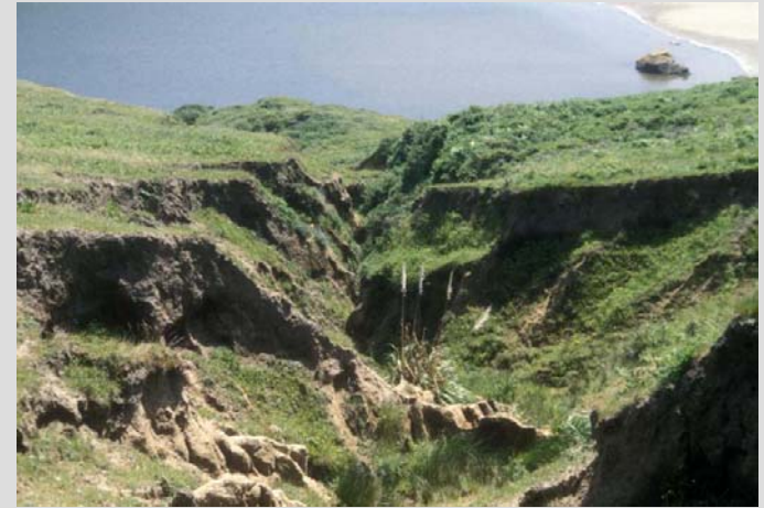
Erosion ~ Soil Loss

Ammophila arenaria Agrostis capillaris ( A. tenuis ) Anthoxanthum odoratum Arrhenatherum elatius Briza maxima * Bromus diandrus * Cortaderia jubata Festuca arundinacea Holcus lanatus Lolium perenne Nassella manicata Pennisetum clandestinum * Annuals