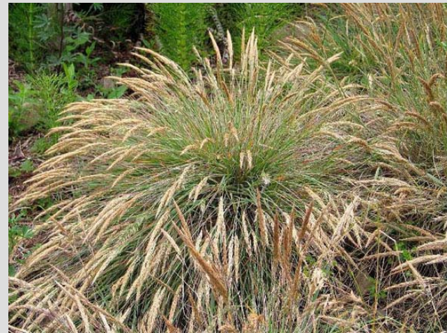
Calamagrostis foliosa (Cape Mendocino reedgrass)