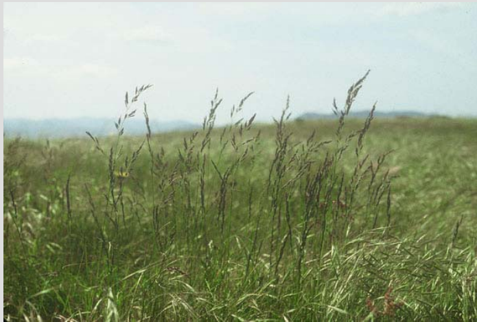
Festuca rubra ~ Pt. Molate