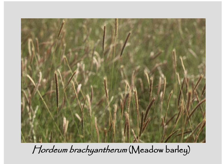
Hordeum brachyantherum (Meadow barley)