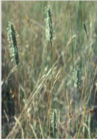
Alopecurus aequalis var. sonomensis