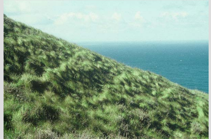
Festuca rubra ~ Big Sur Coast