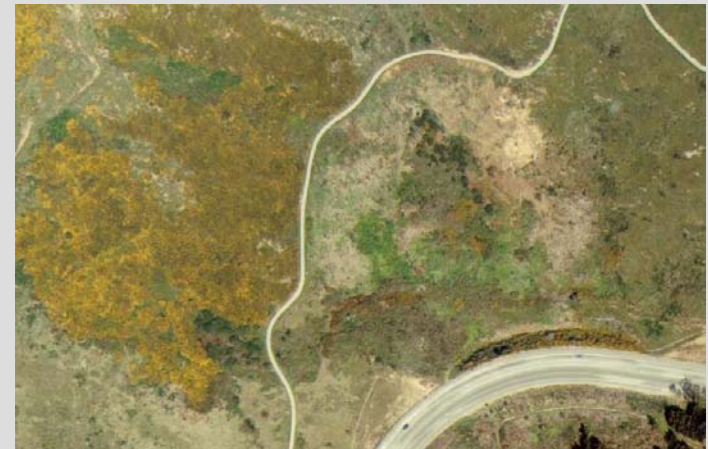
Gorse ~ San Bruno Mountain