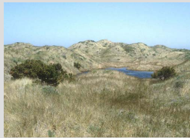
Slack Dunes - Point Arena/Oceano Dunes