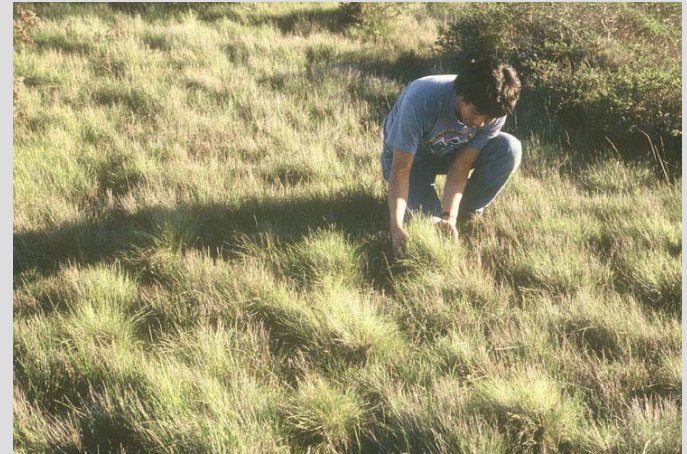
Festuca idahoensis roemerii – Angle Island