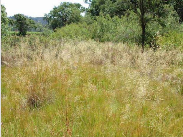
Deschampsia caespitosa beringensis – Napa Valley